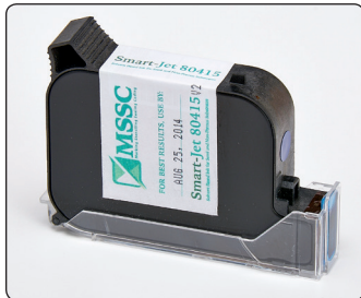
HP TIJ 2.5 technology