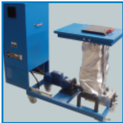
Easy access for maintenance