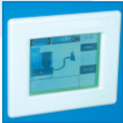
Touch screen panel for easy operation control

PLC based control technology connected to your production line network