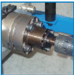
HS compatible pump to ensure stability in performance