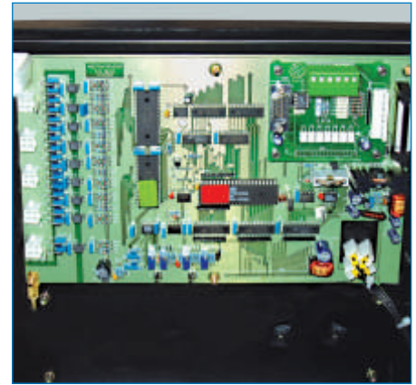
Optional RS485 connection with modbus protocol