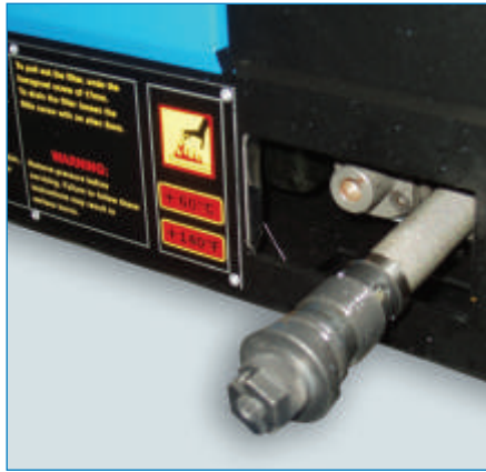
Filter with pressure discharger