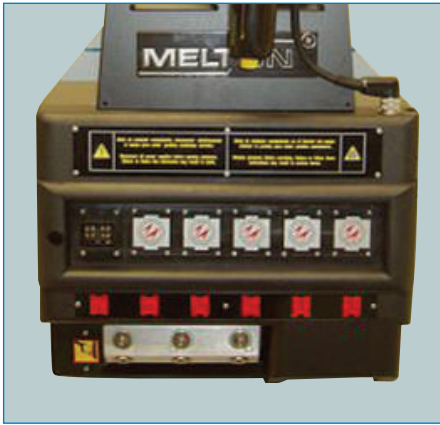
Up to six compatible channels for hose-gun connection