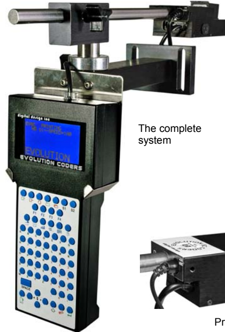
The complete system